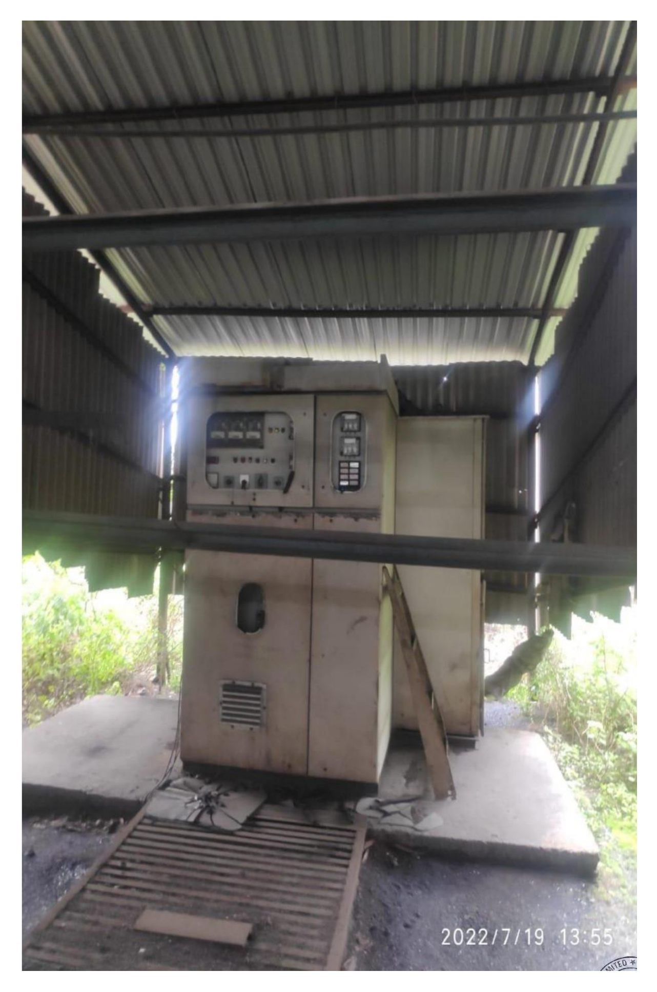
Page 43 of 45